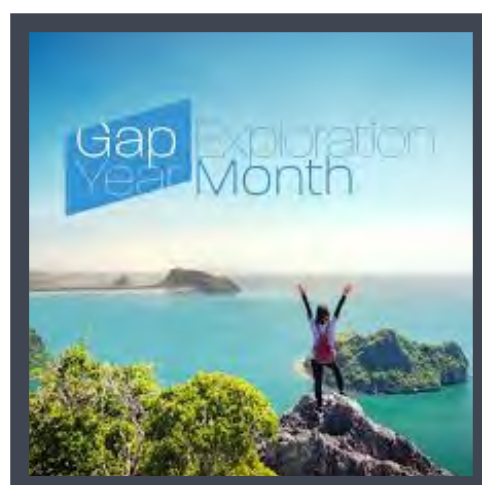
Gap Year Exploration Month logo & graphics.